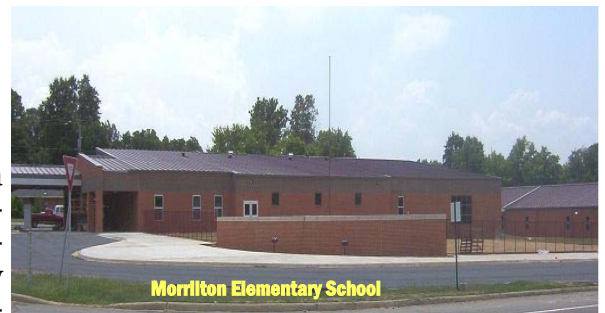
Morrilton Elementary School

The new facility will have a computer lab with all new equipment, a 3000 square-foot library, an indoor physical fitness area, a covered parent pick-up and drop-off area, security fencing and electronic locks, and secured entries to maximize the safety of the children.